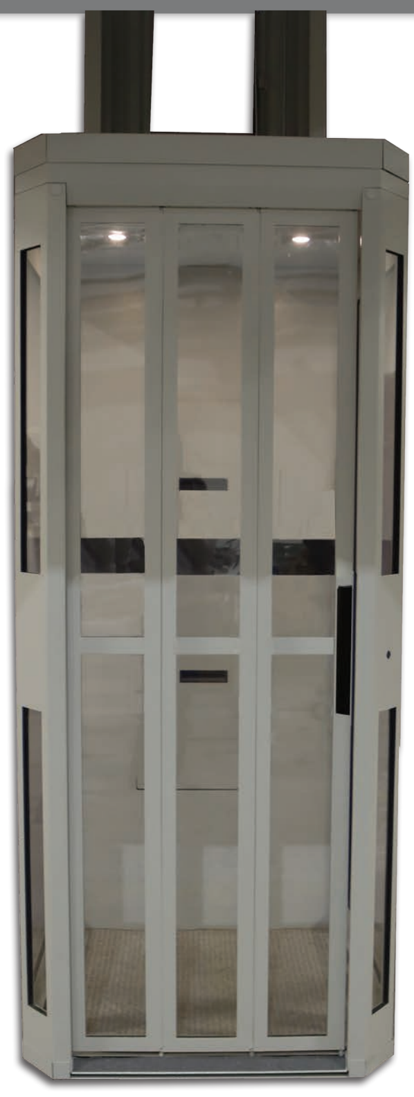
Shown with standard integral handrail, flip down seat in up position, 2 LED lights with Black trim rings, and integrated sliding door in closed position