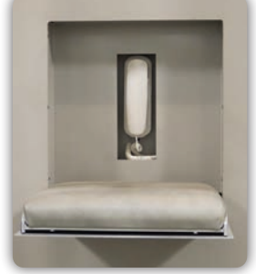
Slimline Phone and Flip Down Seat