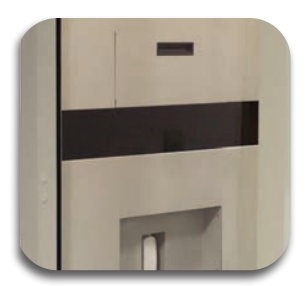
Accent Panel shown above flip down seat in standard Black